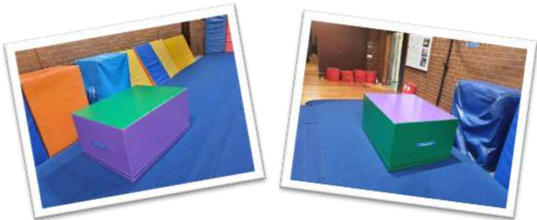
Spotting boxes in Club colours