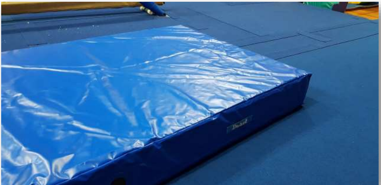
Recovered crash mat